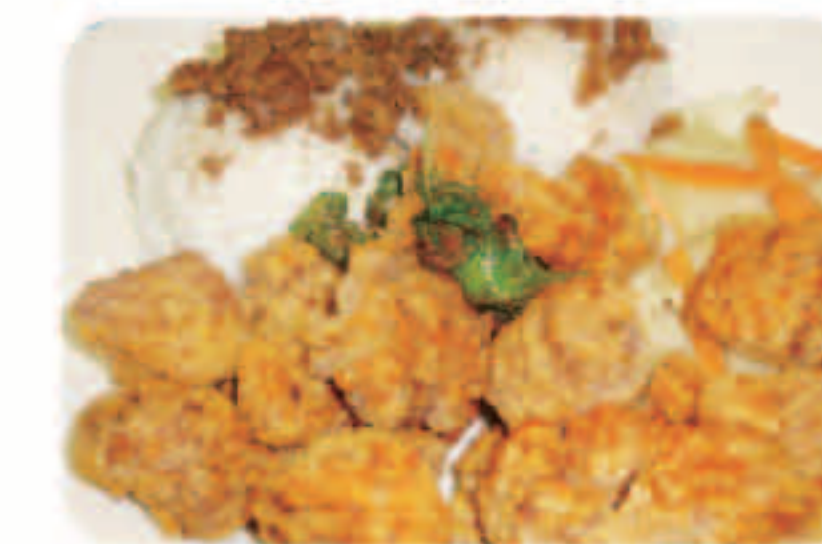
B2 Taiwanese Chicken Combo 鹽酥雞套餐 $11.95