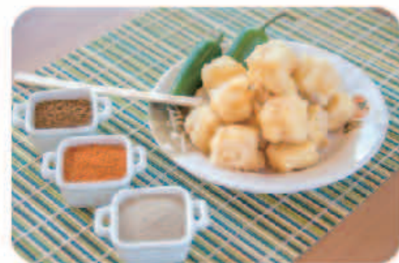
A4 Fried Tofu 酥炸豆腐 $5.95