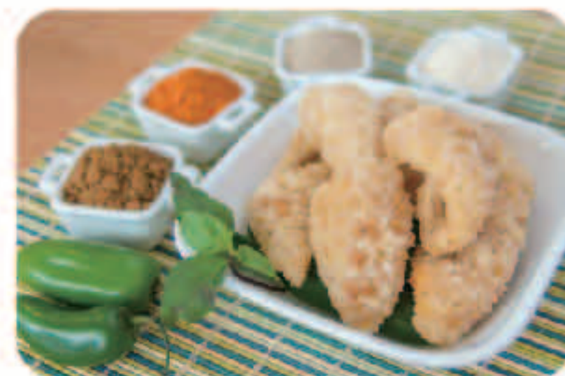
A3 Fried Squid 鹽酥花枝 $9.65