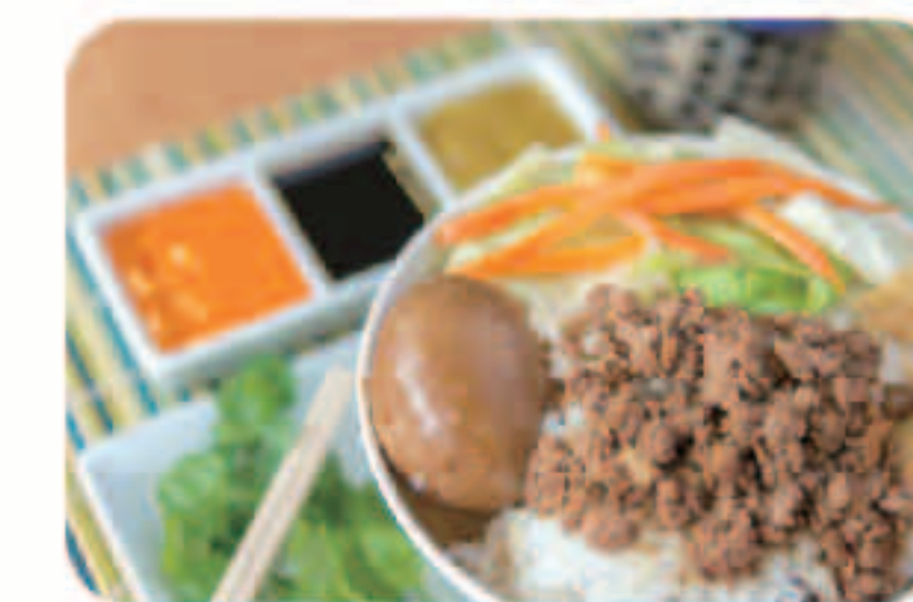
B1 Oriental Ground Pork on Rice and Boiled Egg 肉燥飯 $6.95

All combos come with ground pork sauce over rice and a side of house vegetable.