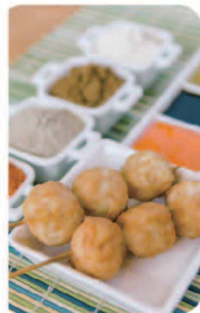
A5 Fried Squid Ball 炸花枝丸 $5.95