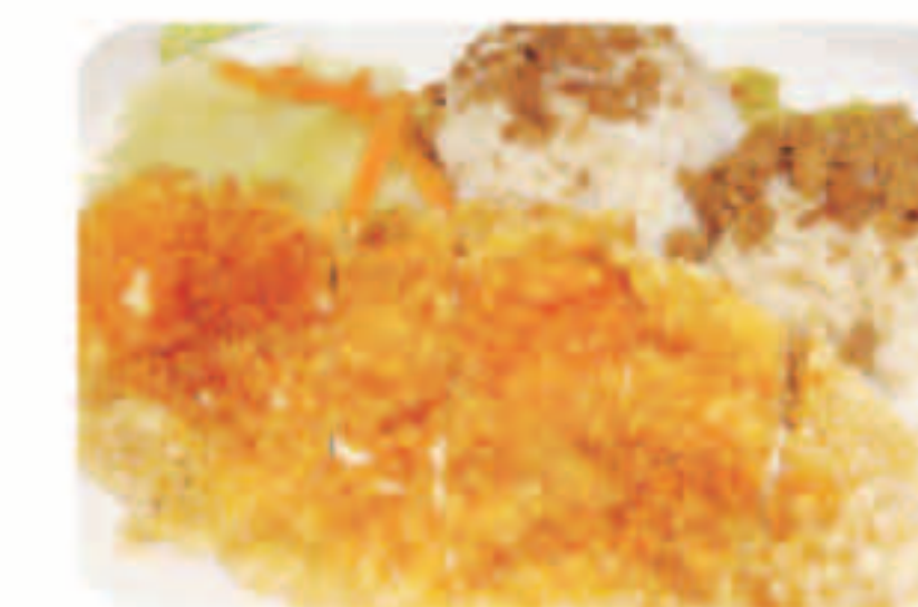
B3 Crispy Asian Chicken Combo 香雞排套餐 $11.95