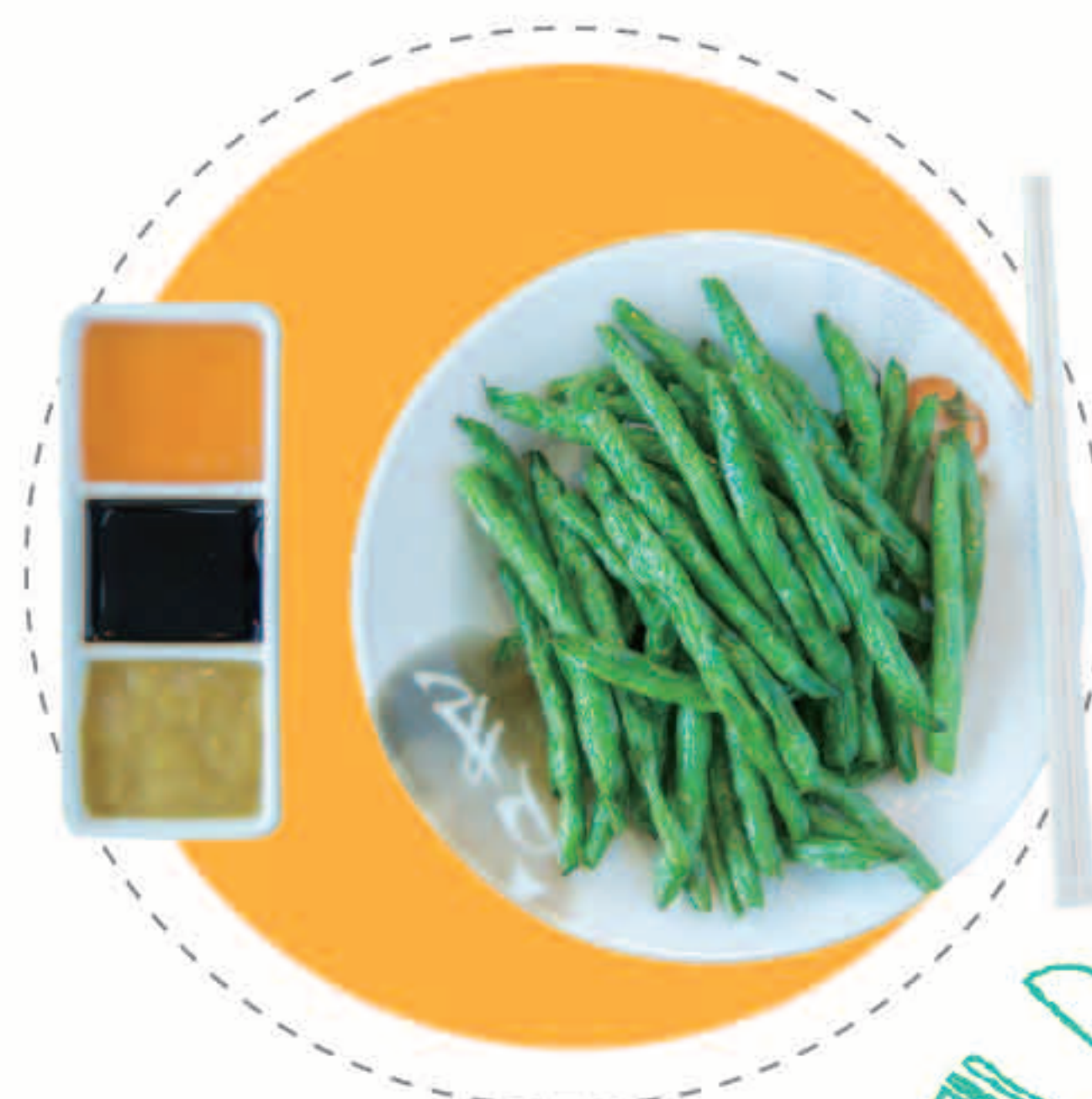
A12 Fried String Bean $6.95 炸四季豆