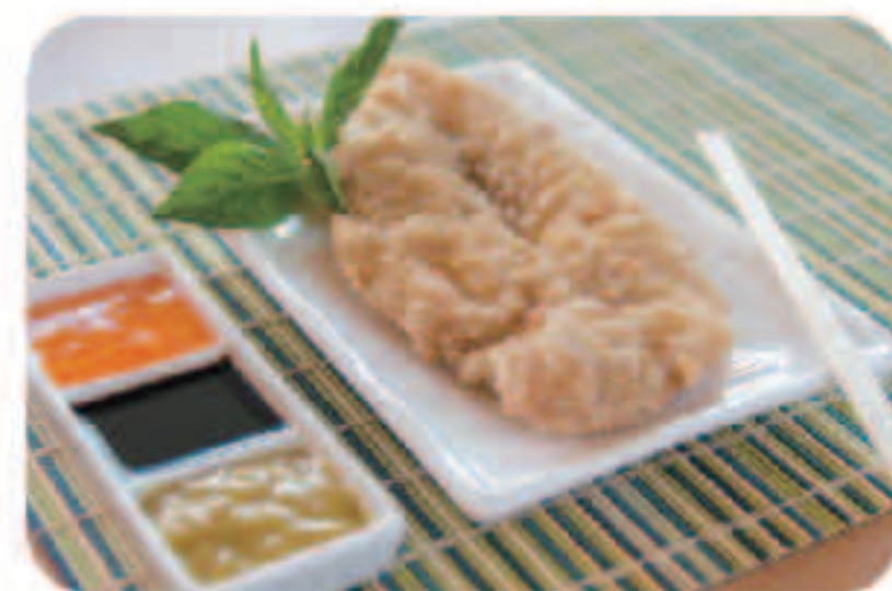
A2 Crispy Asian Chicken 香酥雞排 $8.65