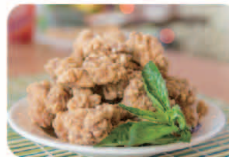
A1 Taiwanese Chicken 鹽酥雞 $8.65