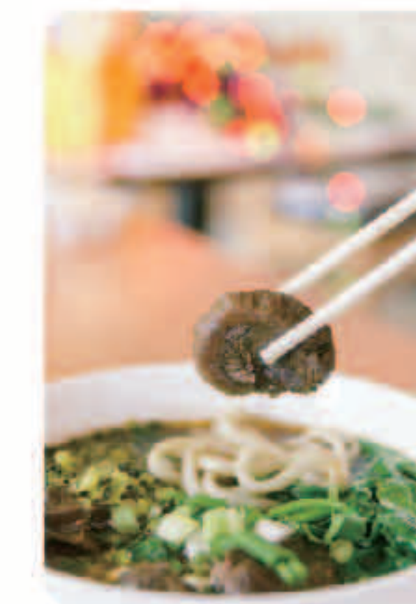
B7 Beef Noodle Soup 牛肉麵 $12.95