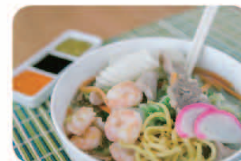
B6 Combo Udon Noodle Soup 什錦烏龍麵 $12.95