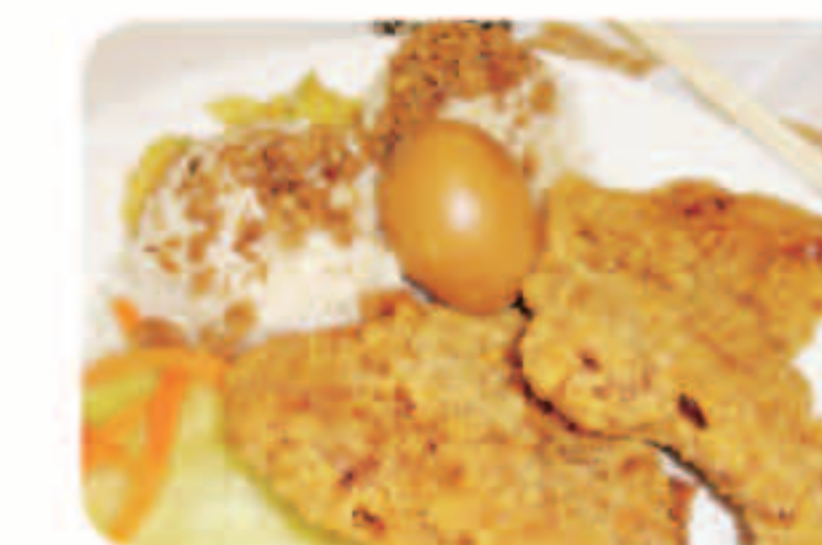
B4 Pork Chop Combo 排骨飯套餐 $11.95