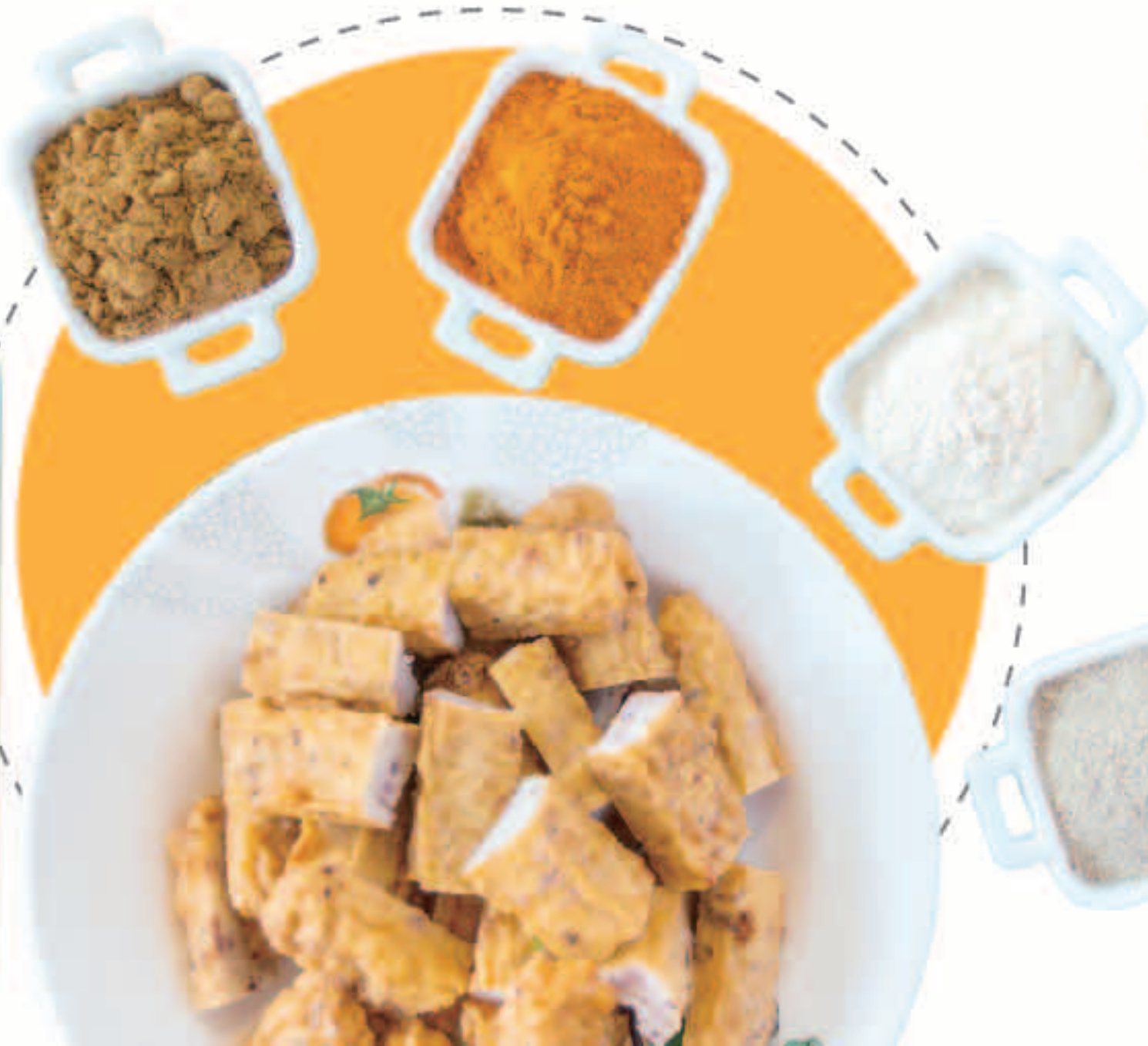
A11 Fried Tempura (fish cake) $7.85 炸甜不辣